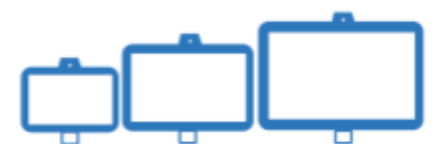
3 sizes available 10, 15 and 21 inch